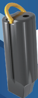
Cartridge Design Battery Pack