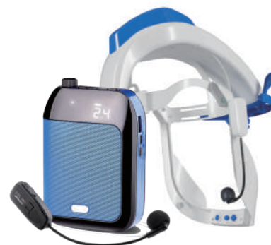
Wireless Microphone 1000-11