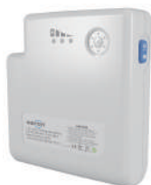
Rechargeable Battery Pack 1000-10